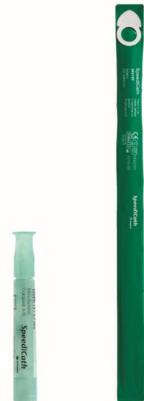
SpeediCath Compact for Women

Coloplast Corp. Minneapolis, MN 55411 The Coloplast logo is a registered trademark of Coloplast A/S. © 2014 Coloplast Corp. All rights reserved.